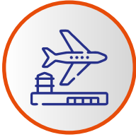
Opposite to Airport