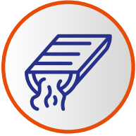
Road side gutters