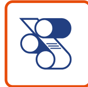
Paper & Printing