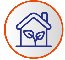
Healthy Industrial Environment